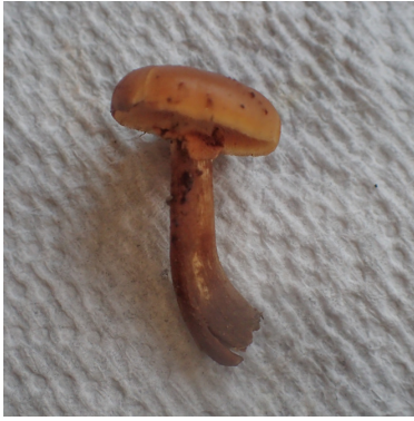
A Cortinarius sp.