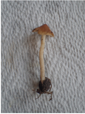
An entoloma sp with very rounded knobby spores.