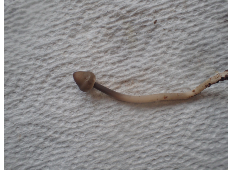
Tiny conical cap with long stout stem