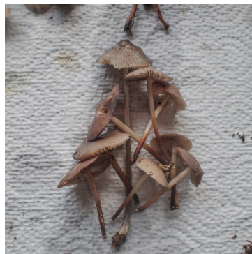
Lots of these Mycena spp with red base to stipe